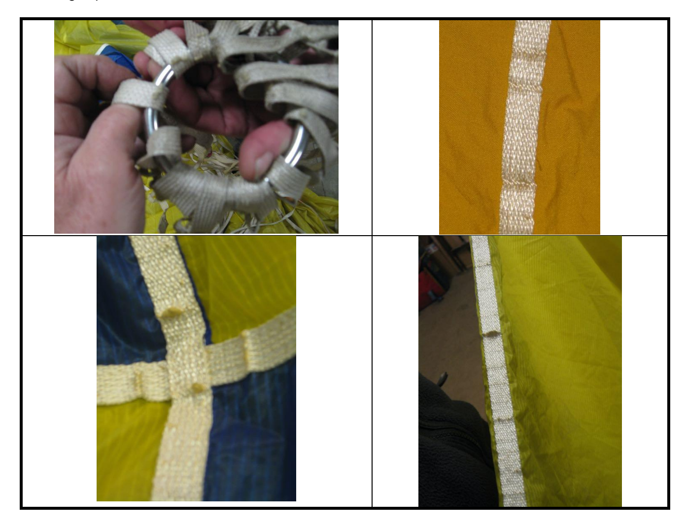
Figure 1: Examples of load tape damage

Although the maintenance manual states no damage to the load tapes is acceptable, an unsafe condition could exist as the rate of degradation is unknown and the residual strength of the tape, following exposure to UV, cannot be determined.