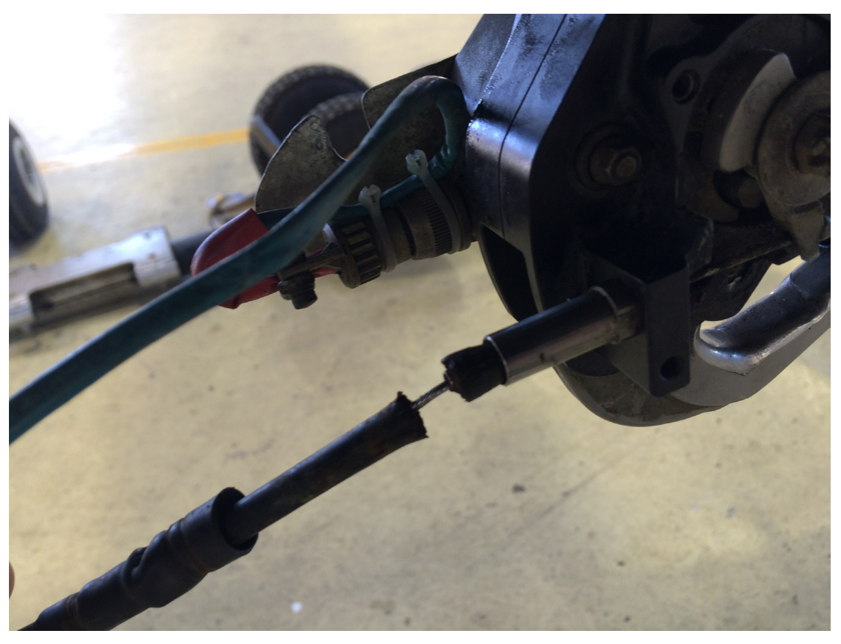
Cable conduit fractured approximately 50mm forward of the cargo hook.