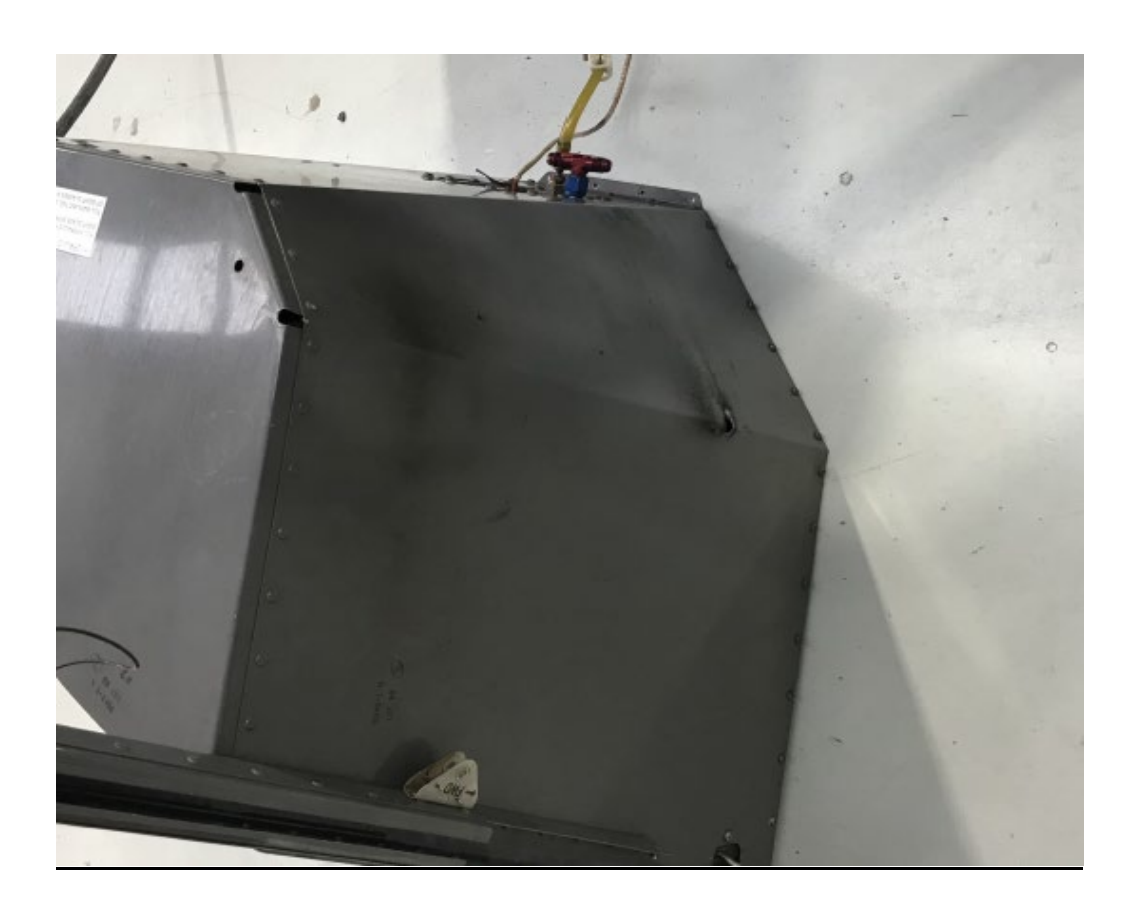
Fig 2. Example of correct orientation of the fittings and hoses