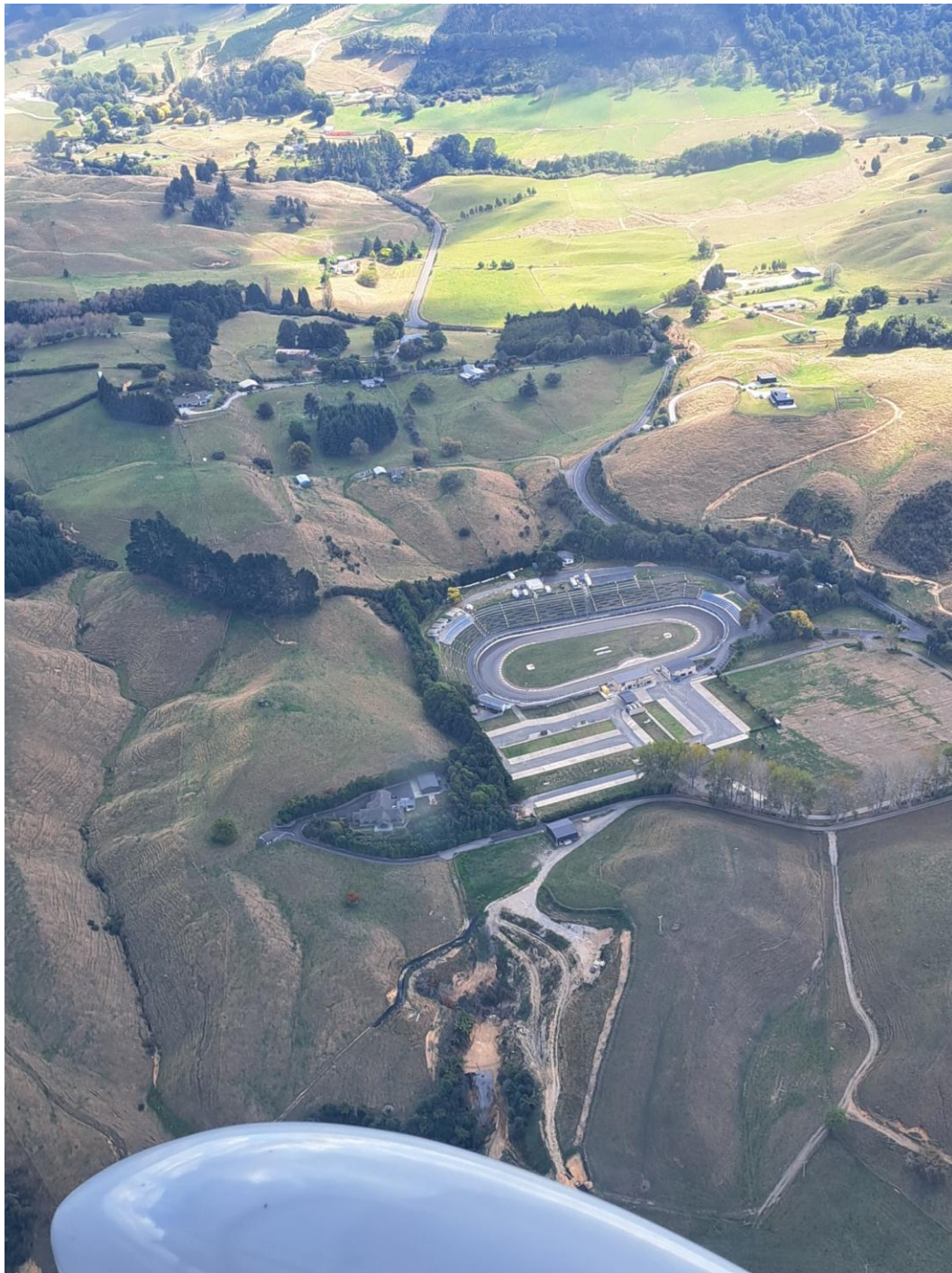
Figure 1: Aerial view of Paradise Valley Speedway.