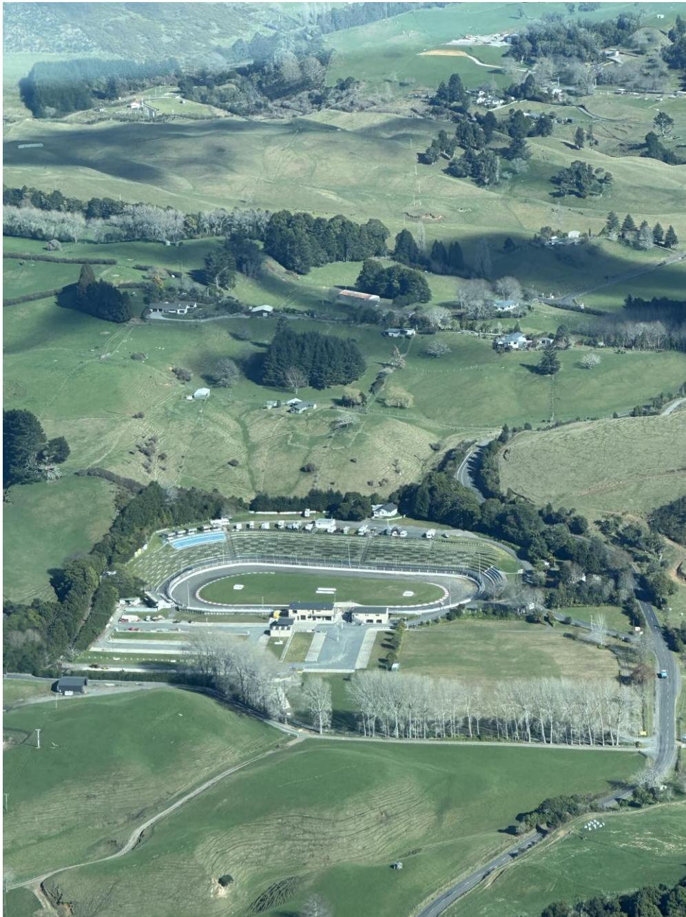
Figure 5: Aerial view