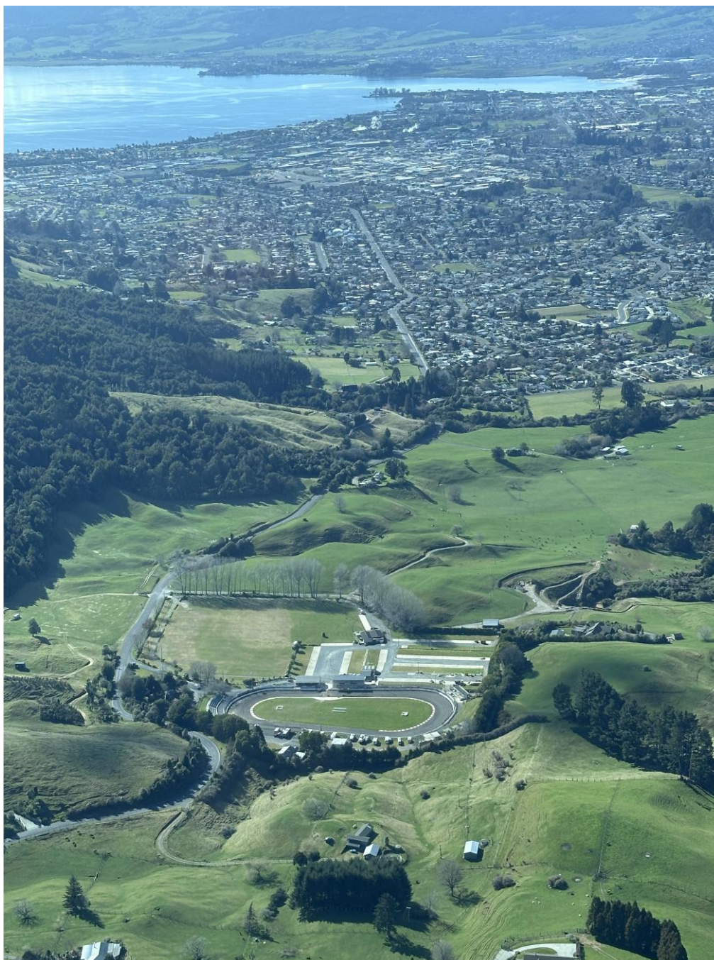
Figure 4: Aerial view Approaching from the South West