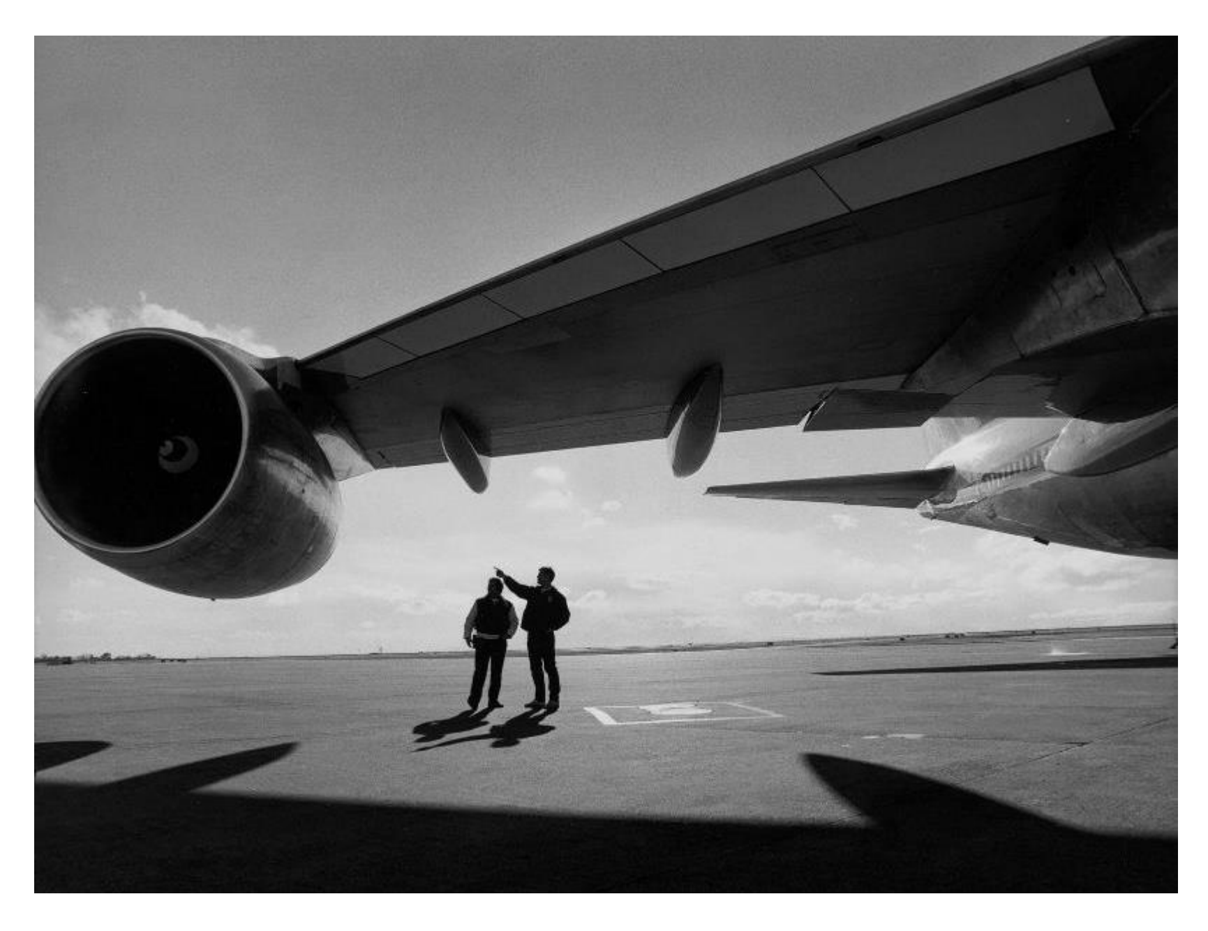
Man pointing at aeroplane engine