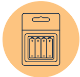
Spare lithium batteries* (with terminals protected)