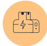
Power tool batteries