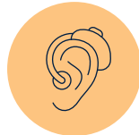
Hearing aid chargers