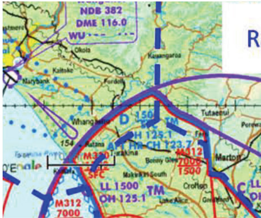
Figure 2 – Reduction of M310 / M312