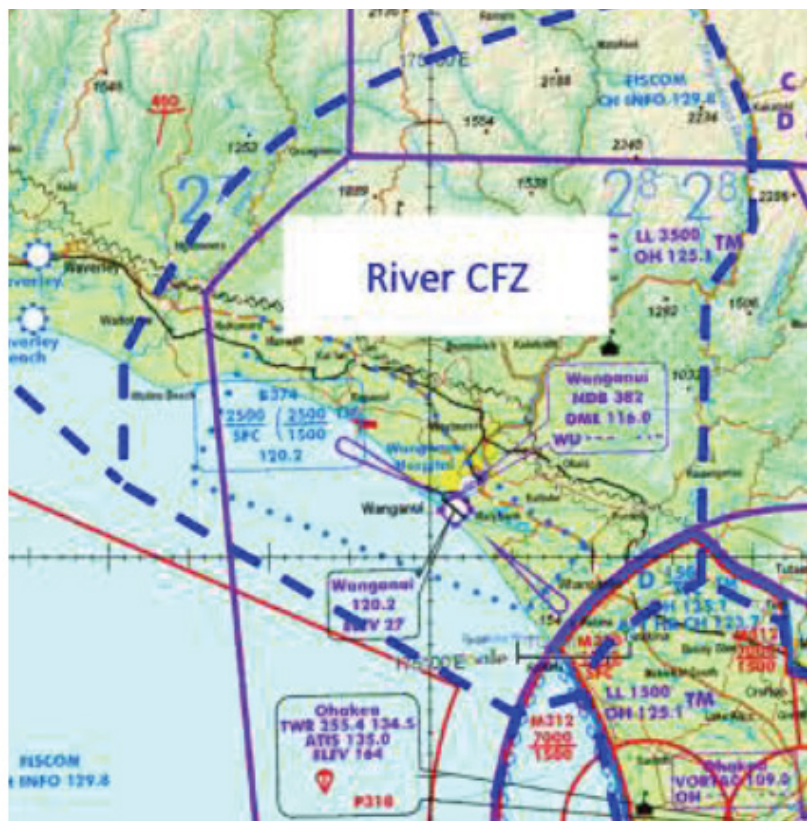
Figure 3 – River CFZ (Wanganui area)