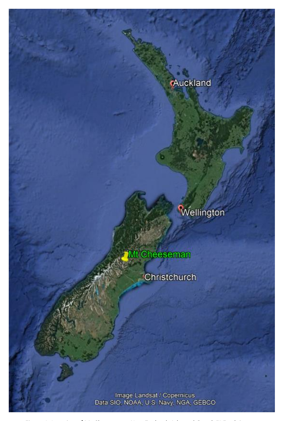
Figure 1: Location of Mt Cheeseman, New Zealand. Adapted Google™ Earth image.