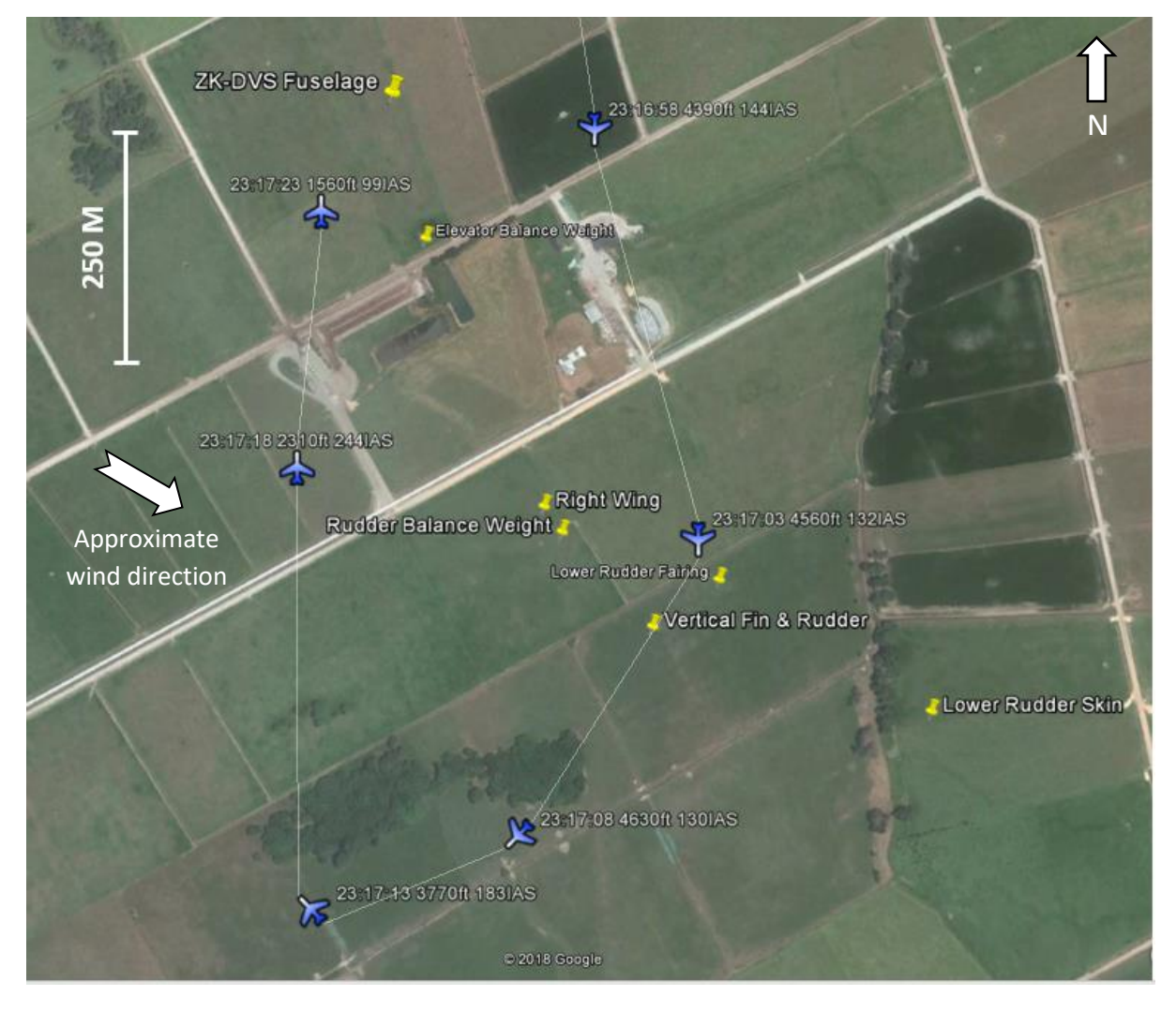
Figure 1: Wreckage distribution and aircraft position reports from EFIS