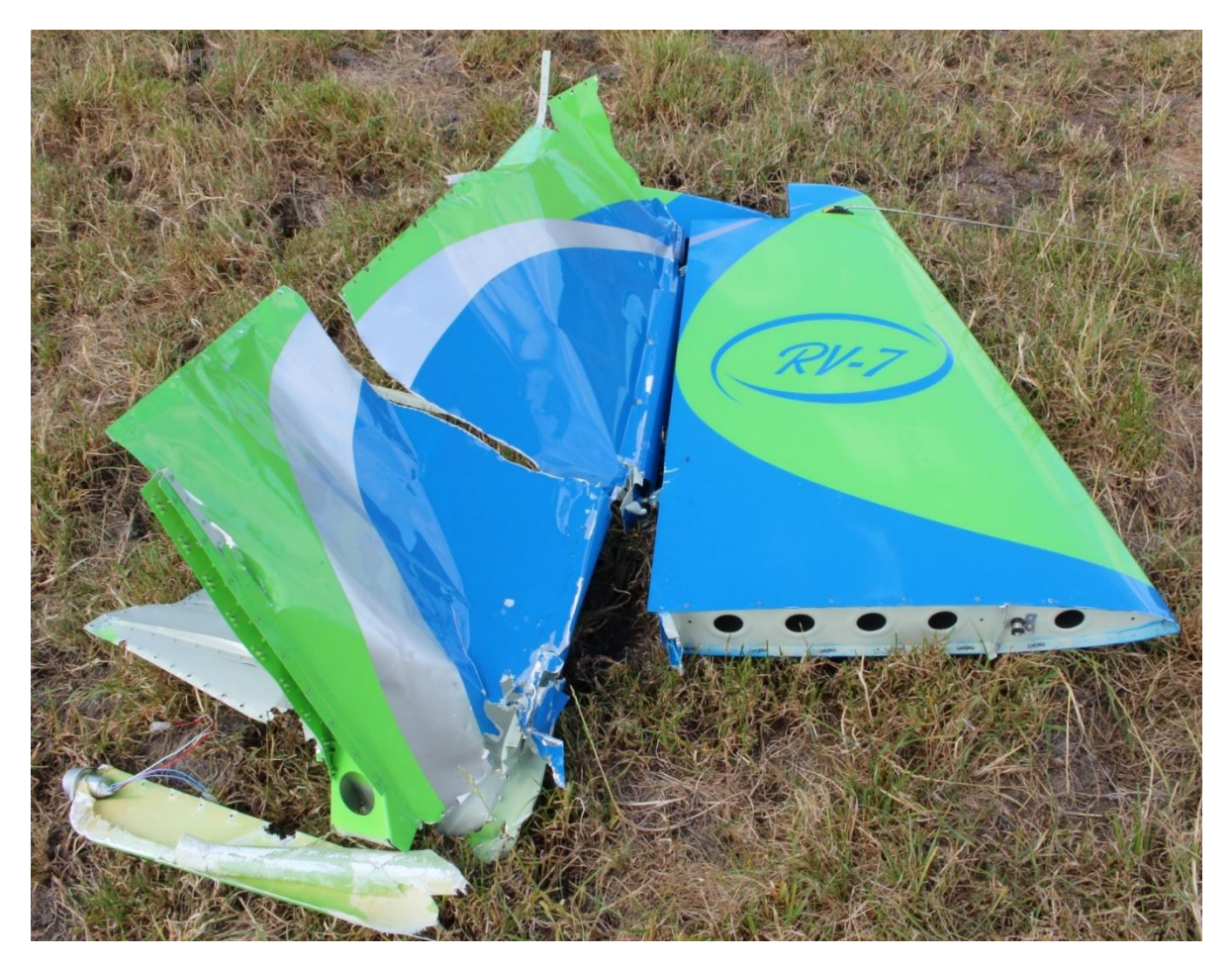
Figure 4: Rudder and vertical Stabiliser from ZK-DVS

Liaison with the National Transport Safety Board (NTSB) and the Transport Safety Board of Canada (TSB) enabled detailed comparisons of the damage signatures to be made to those analysed on ZK-DVS. Similar characteristics were exhibited in all.