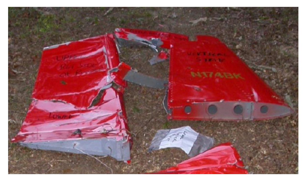
Figure 5: Rudder and vertical stabiliser from N174BK