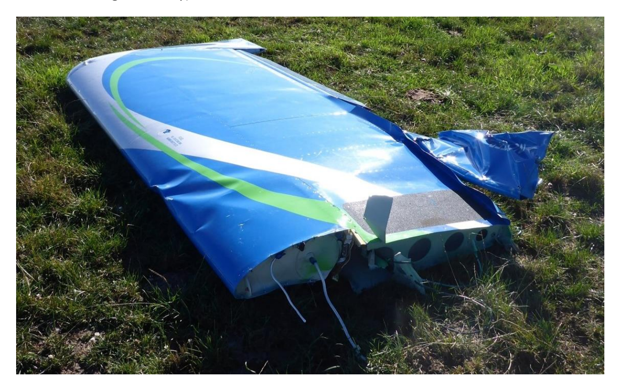
Figure 3: Right wing (Source: scene investigation)

Figure 2: Main wreckage (Source: scene investigation – note: strop around wing used for aircraft wreckage recovery)