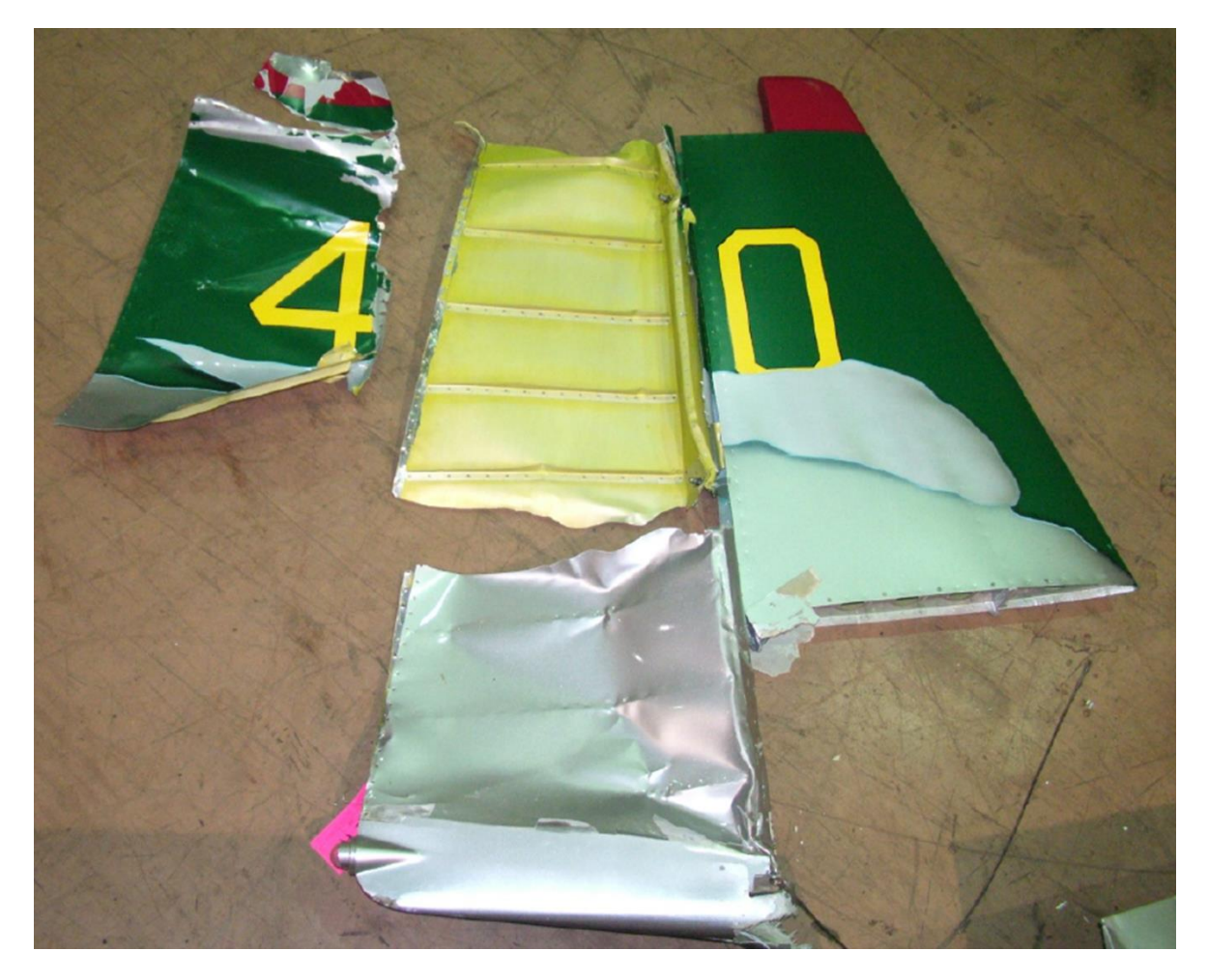
Figure 6: Rudder and vertical stabiliser from C-GNDY