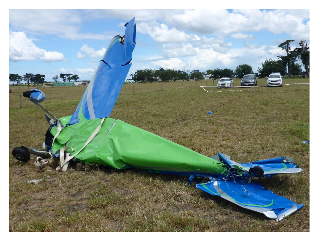
Figure 2: Main wreckage (Source: scene investigation – note: strop around wing used for aircraft wreckage recovery)