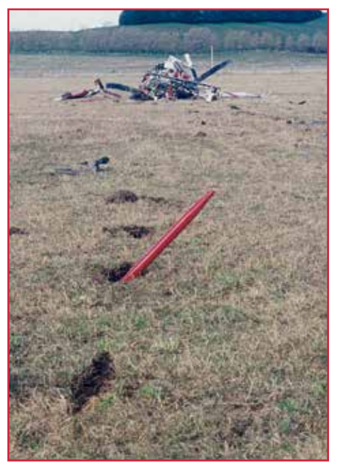
'Witness marks', such as the ones left by rotor blades in this picture, can provide investigators with vital clues as to the accident cause. Investigators placed a strut in one of the holes to show the angle of the blades when they struck.