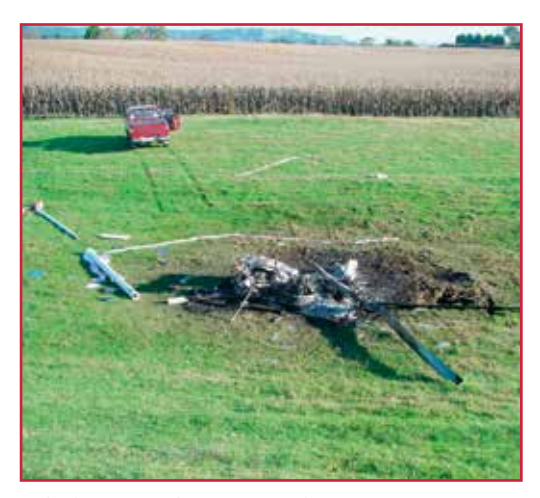
Vehicle tyre tracks can cause damage to witness marks, if an accident site is uncontrolled.