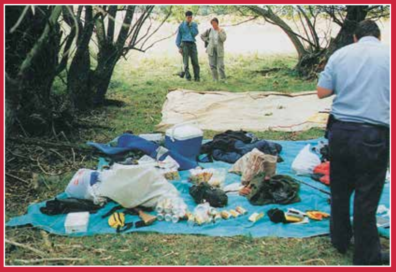
A police officer stands guard over the luggage content of an aircraft that crashed shortly after takeoff.