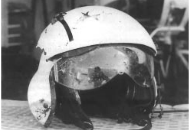
This helmet and visor protected the pilot of a Canadian Bell 206 when a large bird (Western Grebe) came through the windsreen.

You can bet your sweet (expletive) they do. They have in the past, and will continue to save lives and serious injury in accidents yet to happen. Give them whatever name you wish — electric hat, bone dome, brain bucket, hero hat or, that old standby, flying helmet — they work as advertised.