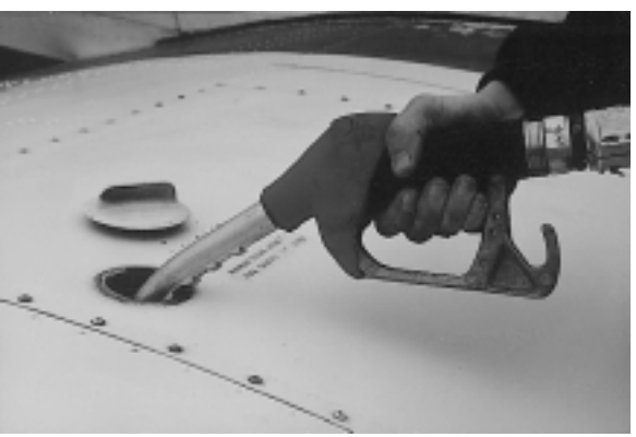
The fuel pump nozzle should be kept in contact with the side of the filler neck at all times while fuel is being delivered. This ensures that a potential difference does not develop between the area surrounding the filler neck and the nozzle.

In recent years there has been a change in philosophy and practice with regard to grounding. In the 1990 edition of the [US] National Fire Protection Association Standard for Aircraft Fuel Servicing