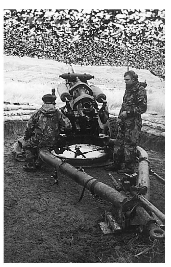
A long barrel L-118 Light Gun in action in the Waiouru Training Area (NZM301). This gun is capable of firing a projectile a distance of up to 18 kilometres.

In the South Island, there have been instances of aircraft flying through the permanently active M800, Glentunnel. This small red circle on the chart in the foothills of Canterbury may seem harmless and be easily overlooked, but it surrounds an army magazine, and the hazard to aircraft is very real. Army personnel may