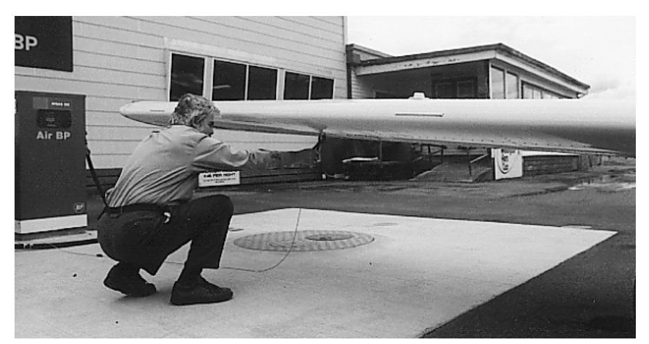
Securely attaching the bonding wire to a non-painted metallic surface (one that can convey an electrical charge to or from the aircraft fuel tank) before refuelling begins will equalise any potential difference that exists between the aircraft and the fuel pump.

The draft GAP booklet reflects these changes.