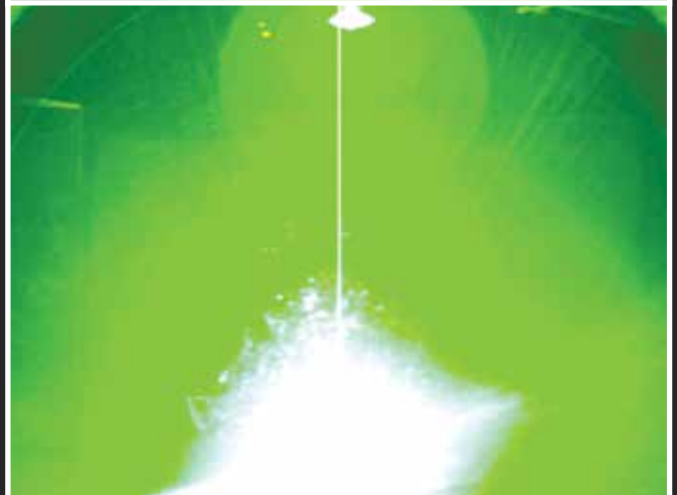
B727 full motion simulator in Oklahoma, using a small laser directed into the cockpit. FAA 2003